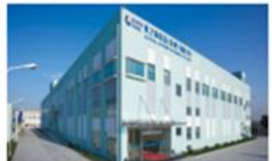
Azuma Foods (Suzhou) Co., Ltd.