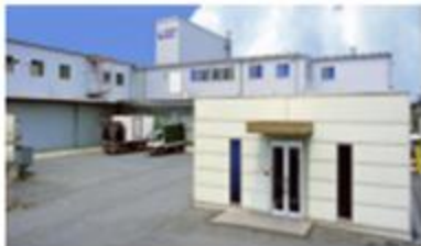
Azuma Foods Co., Ltd. (Japan)