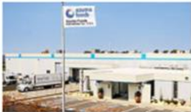
Azuma Foods International Inc., U.S.A.