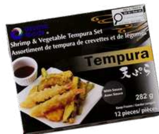
Shrimp & Veggie Tempura Set