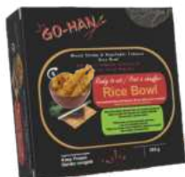
Frozen Tempura Rice Bowl