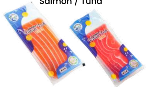
Plant-based Salmon / Tuna