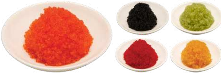
Tobikko / Masago